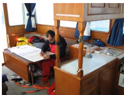
"Sure I know the way!"