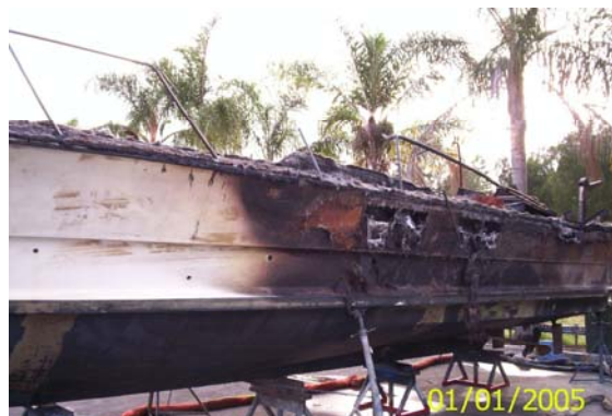
38' Fjord cruiser salvaged after an electrical fire in March